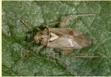
Lygus bug

The importance of breeding for genetic strength, as opposed to relying on chemicals, comes down to the long term successes of each option. When opting for seed resistance, the capacity for the pest to overcome this resistance, as opposed to adapting to a pesticide, is a lot less likely.