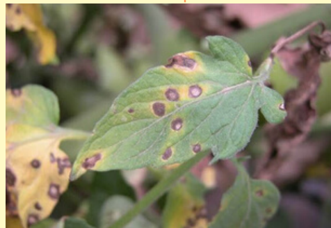
Tomato blight

Putting the power of seeds into the hands of the growers