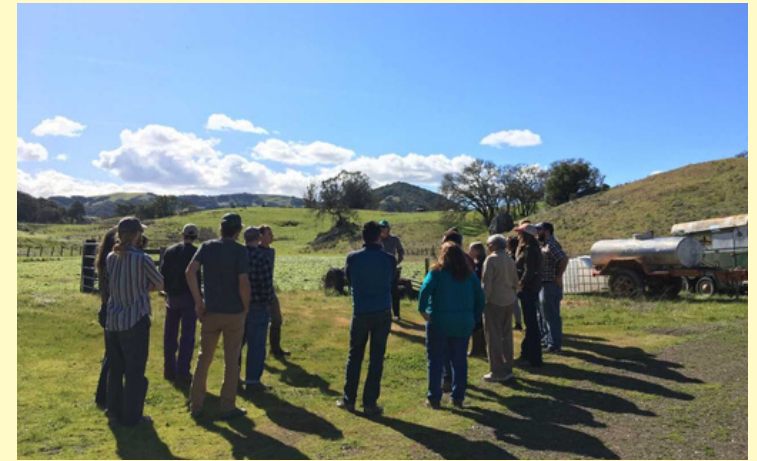
Seed Summit 2018 in Petaluma, CA